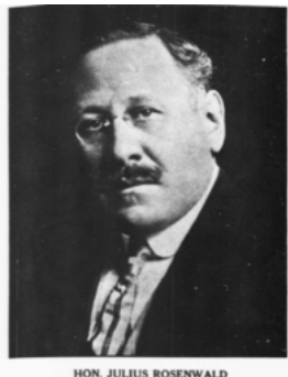
HON. JULIUS ROSENWALD