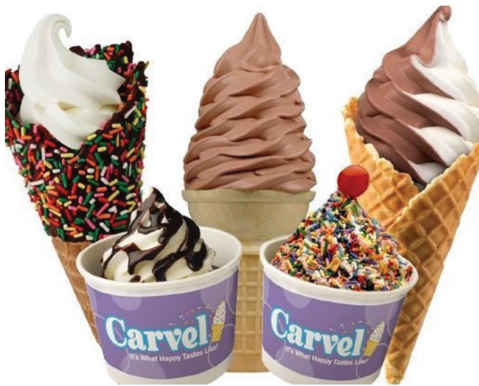
Carvel has a variety of flavors and sundaes options.

Summertime in Highland Park is the perfect time for a stroll downtown to shop or browse through our unique gift shops, jewelry stores, toy stores and more. At some point during the walk, you're bound to come across one of Highland Park's delicious ice cream or candy shops, and their sweet temptations are hard to ignore!