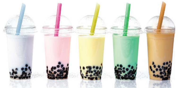
Lady Tea serves refreshing bubble tea, slushies and more.

Highland Park has terrific options for summer treats, so if you get an urge for ice cream or candy, it is the place to be!