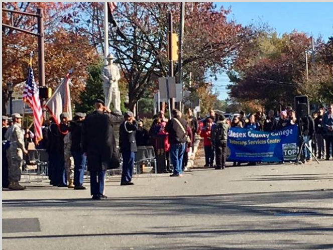
Residents and visitors honored our veterans during the annual Veteran's Day parade on November 11.

**No recycling collection during Thanksgiving week. Recycling will resume as regularly scheduled next week.