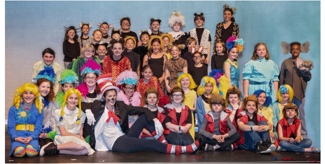
The Highland Park Youth Theatre Company presented Seussical, Jr. last month. The cast performed two shows on May 12 and May 15. Congratulations to all participants on a wonderful show!

The Highland Park Youth Theatre Company launched in Fall 2011 as a place where budding young artists could work on their acting, singing and dancing skills. Operated through the Highland Park Recreation Department, the program is open to children ages 8-16 years and produces three musicals per year, one of which is performed at the town wide Fireworks celebration. To sign up for the next session beginning May 26 please contact the Highland Park Recreation Department at 732-819-0052.