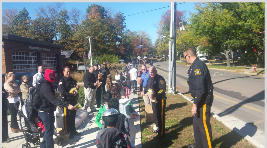
The Highland Park Police PBA #64 handed out over 500 glow sticks and glow bracelets to Bartle School Children to be worn while trick or treating

I want to wish everyone a happy, safe, and healthy Thanksgiving filled with the warmth of family and friends. I am thankful for the opportunity to serve you as Mayor, and look forward to working with you in helping our community continue to grow and develop in the coming year.